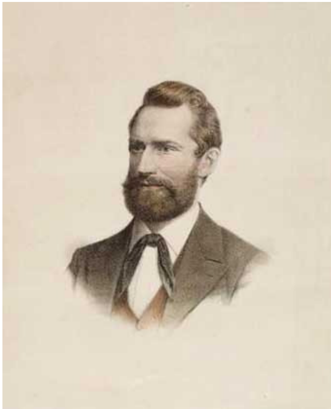
Fig 1. Leichhardt portrait

Reenactment as temporal collapse of two moments: