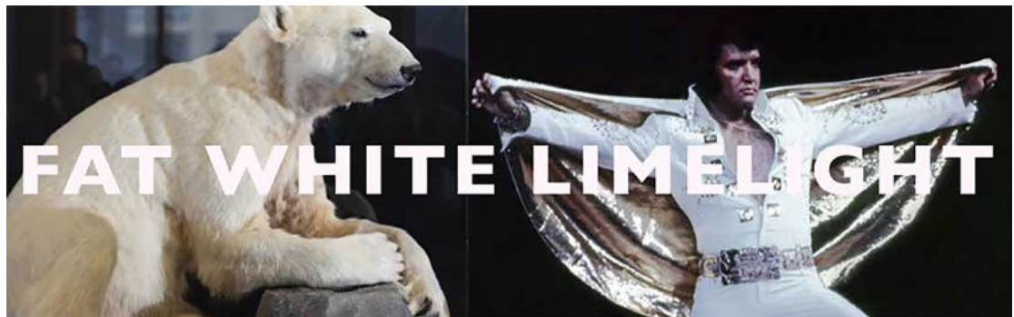
Fig 4. Knut as Elvis

What are we doing with Leichhardt after 200 years?