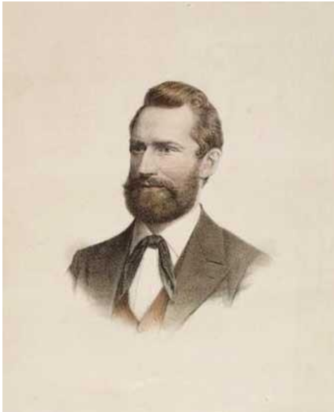
Fig 1. Leichhardt portrait

Reenactment as temporal collapse of two moments: